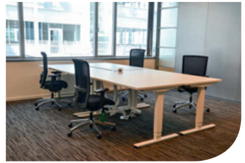
office with 4 stand-sit desks